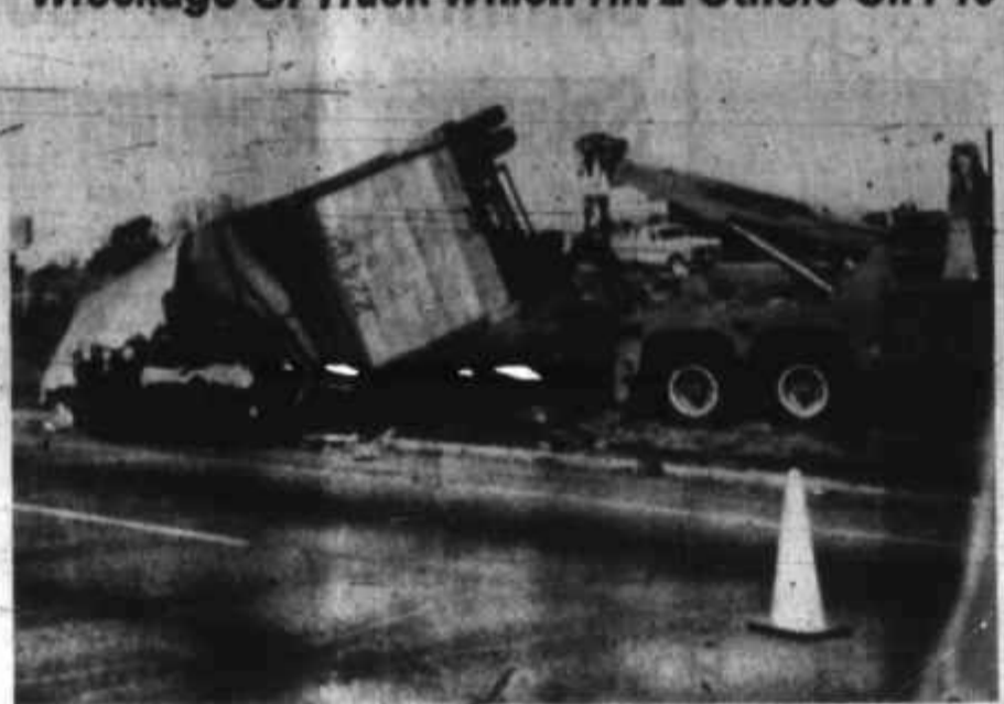
Shown above is the wreckage of the large van truck carrying a load of groceries which plowed into the back of two parked trucks on I-10 just east of the FM 102 and IH-10 intersection early Monday morning. Two persons received injuries and heavy damage resulted to at least two of the trucks and trailers.