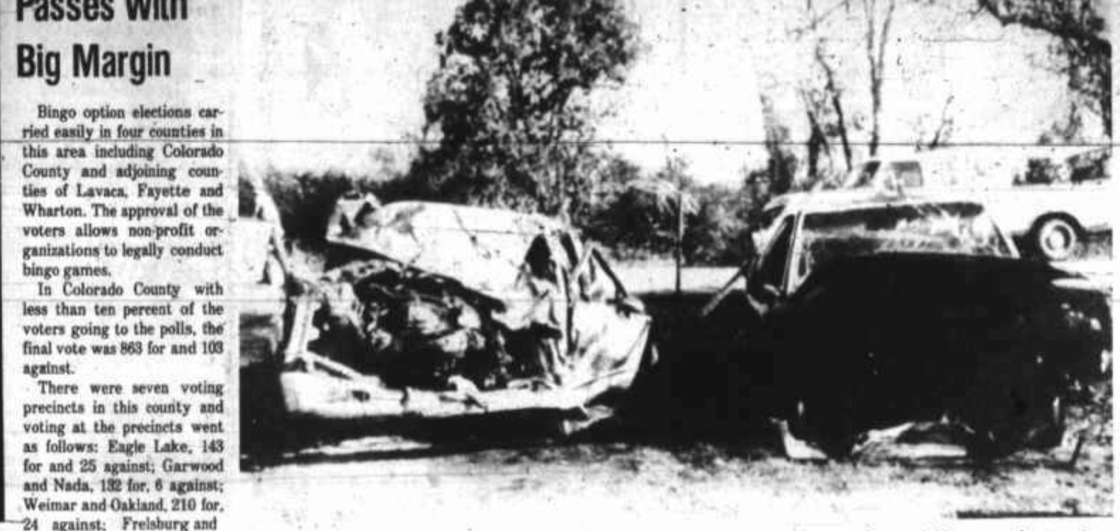
These are the crumpled ruins of two automobiles in which four persons met their death in a tragic head-on collision in heavy fog on Highway 90A just east of the Eagle Lake city limits in front of Shindler Car Wash at around 5:00 a.m. Saturday. The accident, one of the worst ever in this area, claimed the lives of two young men from Eagle Lake, Dennis Wilkerson, 24, and Donnie Perry, 23, and two visiting goose hunters from East Texas. All four fatalities were in the front seats of the respective cars. Two persons, one in each vehicle, were injured but are expected to recover.